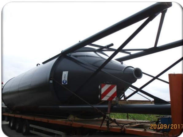
Open Plateau (2- and 3axis)