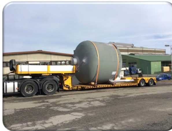
Lowbed (5axis / 40cm high)